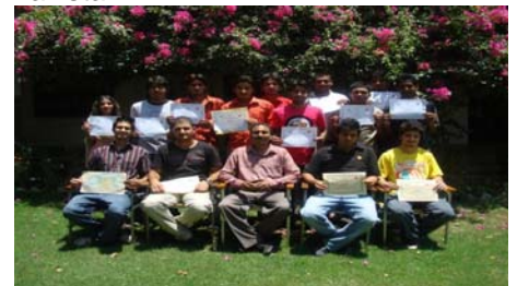
The successful candidates of the training program

In June, 2010, The Youth Desk, with the collaboration of IEARN (International Education and Resource Network, Pakistan) organized an Online Computer Course about Internet Programmes, for the Christian youth of Peshawar. A class of 10 students was equipped with the latest knowledge of Internet Programming. At the end of the course, the students were awarded Certificates by the IEARN Head Office, Karachi, Pakistan.