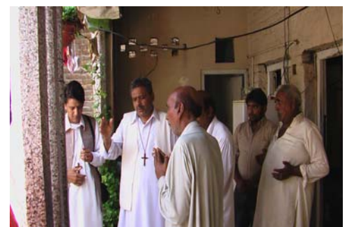
Home visitations of the Diocesan Team