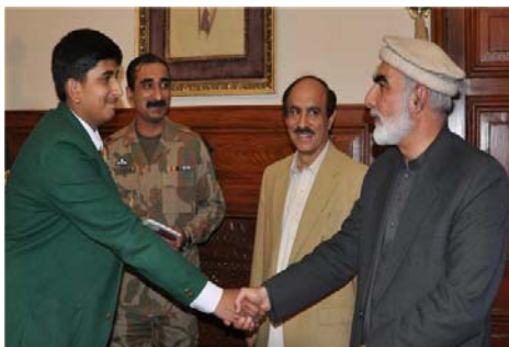
The Governor presenting awards

In a graceful ceremony at Khyber Pearl Continental Hotel, Peshawar, the Governor and the Chief Minister of the Province distributed the trophies to the winners.