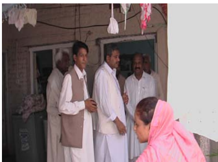
Visit of the damaged houses