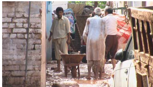
Damaged houses at Tarnab Farm