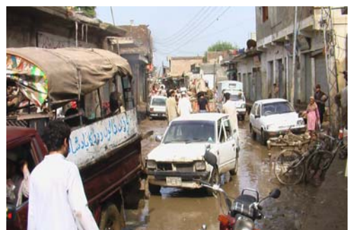
A view of Charssadda main bazar