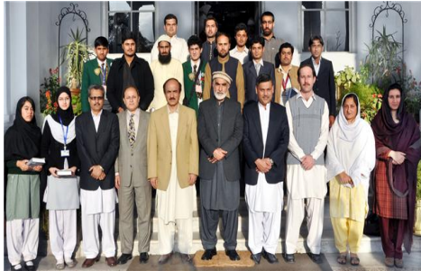
Governor (middle) with staff & students

Edwardes College School is one of the most popular 'School Systems' of the Province.