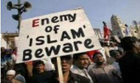
Muslim community protesting against Christians

Local mosque launches protests against Christians