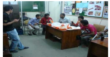
Group discussion of the trainees

The Resource Centre initially provides Computers training programmes, indoor games, a place for holding discussions, sharing their opinion & ideas and Bible studies, and a small library.