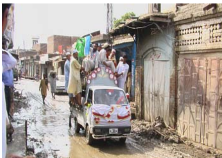
People migrating to safer places