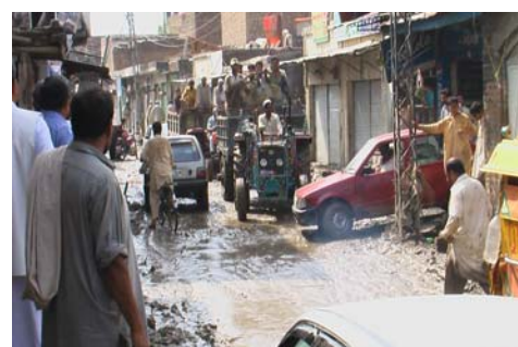
Chaos on muddy &amp; broken roads