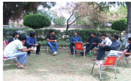
Youth group meeting in progress

The youth desk of the Peshawar Diocese has taken initiatives to divert the youth's undesirable use of technology, into something more rewarding and has started an SMS & Email Ministry. Biblical messages are being sent out to the young people, and instead of sending rubbish messages to each other they now exchange the Word of God.