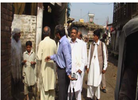
Bishop &amp; his team visiting houses