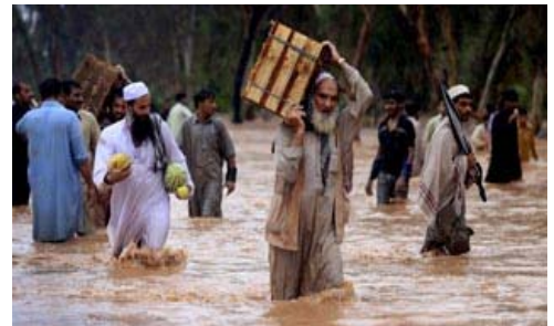
People walking through the flood waters

The monsoon rains have caused havoc all over Pakistan, but the Khyber Pakhtunkwa province has been hit hard by the floods. Thousands of villages are under water and hundreds of people are either dead or missing. All road links within the Province have been cut down; relief workers are trying to reach through boats or on foot.