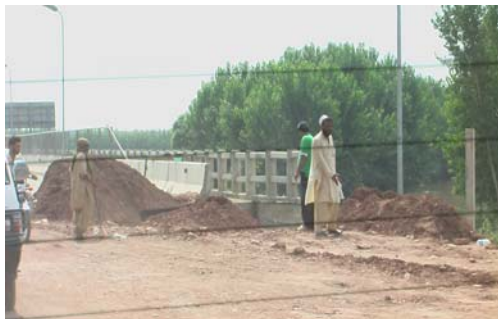
A view of broken roads &amp; bridges