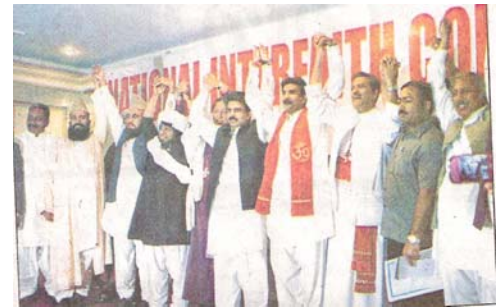
Bishop Humphrey with conference participants

July 12, 2010; In a high level meeting at Islamabad, it was decided to form a 'National Interfaith Council' to promote brotherhood, harmony and co-existence among various faiths.