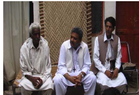
The Bishop consoling the flood victim