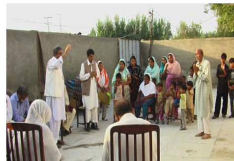
Prayer Meeting held on a roof top