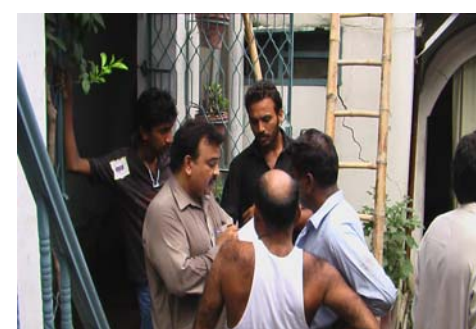
Registration by Dio. Relief Staff

August 2, 2010: Now-a-days, traveling to Charsadda is not safe, as the roads are flooded thus dangerous to travel. The Bishop and the Diocesan Development & Relief workers risked their life and reached there, to help the Christian community trapped in floods. They visited every home and held special prayers for the flood victims. It is worth mentioning that special prayers were offered in the middle of Charsadda Bazar, many Muslims also participated in it.