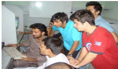
Computer training class in progress

Peshawar Diocese congratulates the winners and their teachers on this remarkable achievement.