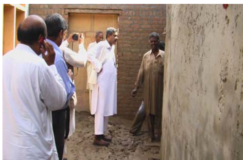
The Bishop inspecting damaged houses

August 2, 2010: Now-a-days, traveling to Charsadda is not safe, as the roads are flooded thus dangerous to travel. The Bishop and the Diocesan Development & Relief workers risked their life and reached there, to help the Christian community trapped in floods. They visited every home and held special prayers for the flood victims. It is worth mentioning that special prayers were offered in the middle of Charsadda Bazar, many Muslims also participated in it.