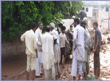
Devastation by Flood at Tarnab Farm